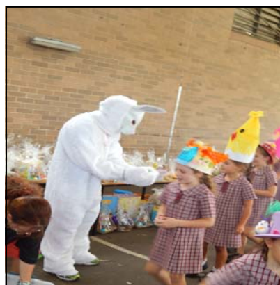
A Photo from our Easter Hat Parade. Photos are on the website.