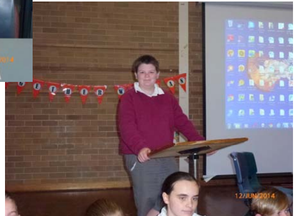
5/6H running assembly