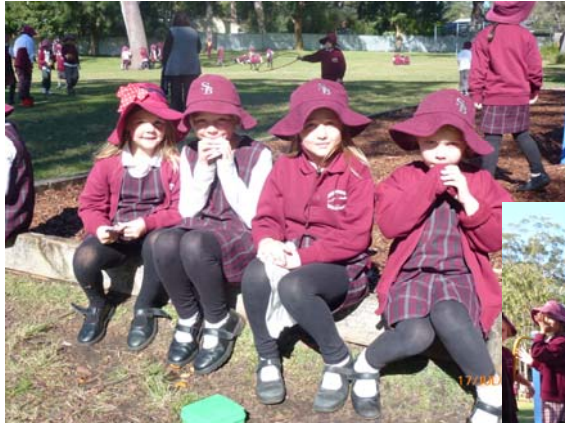
Fun in the playground