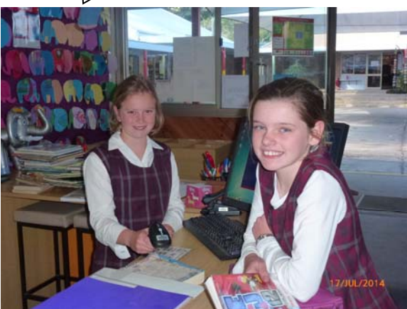
Junior dance group rehearsing