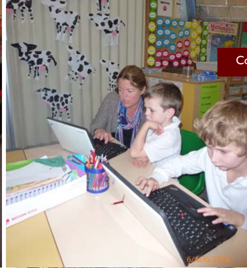
Computer work in IW