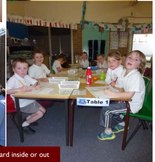
Working hard inside or out