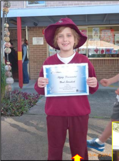
Girls & Boys Touch Teams: Certificate for Outstanding Performance & Sportsman- ship at Nelson Bay Primary School Gala Day