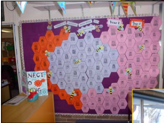
The Library Honeycomb With students from IW Connecting to Reading