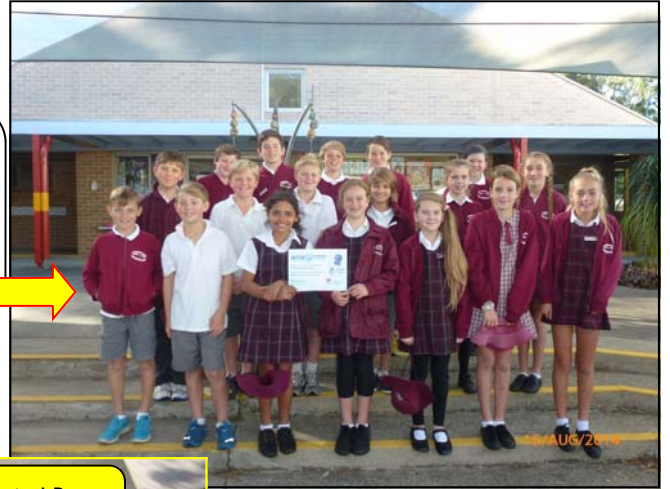
Port Stephens Zone Athletics Carnival Rep- resentatives from SBPS