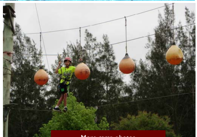
More camp photos