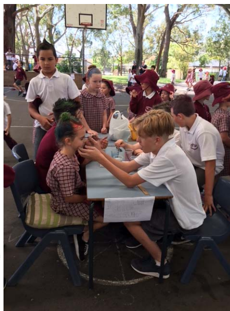
Nuf Nuf activities