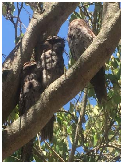
Tawny Frog Mouth Visitors