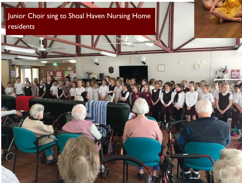
Junior Choir sing to Shoal Haven Nursing Home residents