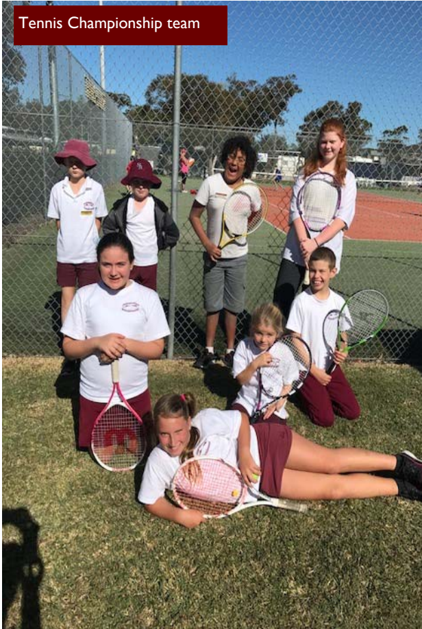
Tennis Championship team