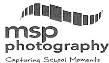
Photo envelopes out TODAY ... check kids bags. Return ON THE DAY to the photographer. Don't forget you can pay online at MSP (not the school). We start with a whole school photo so don't be late.