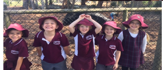
Photo envelopes out TODAY ... check kids bags. Return ON THE DAY to the photographer. Don't forget you can pay online at MSP (not the school). We start with a whole school photo so don't be late.